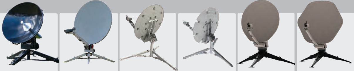
ManPak®T C060FA & C060FM